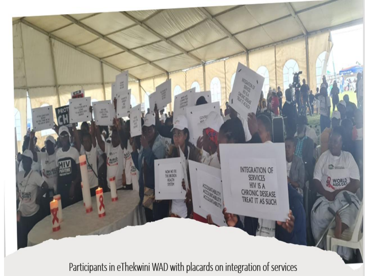
Participants in eThekweni WAD with placards on integration of services

The end of the tale of the ribbon is a solid line on the other side of the theme wording to demonstrate a solidified, equalised, and integrated HIV response.